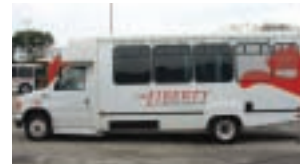
Liberty Parking Shuttle