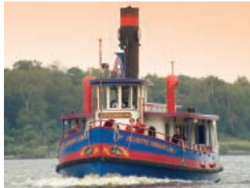
Juliette Gordon Low